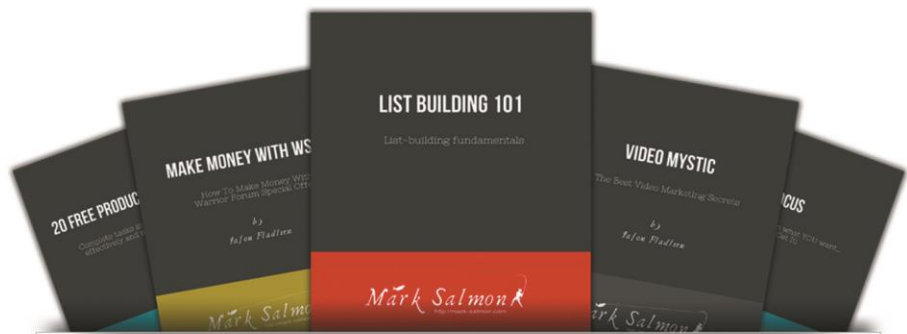
Some of the EBooks I Sell

This is a snapshot from an animated video - I have the software to create animated and sketch videos for promotional purposes